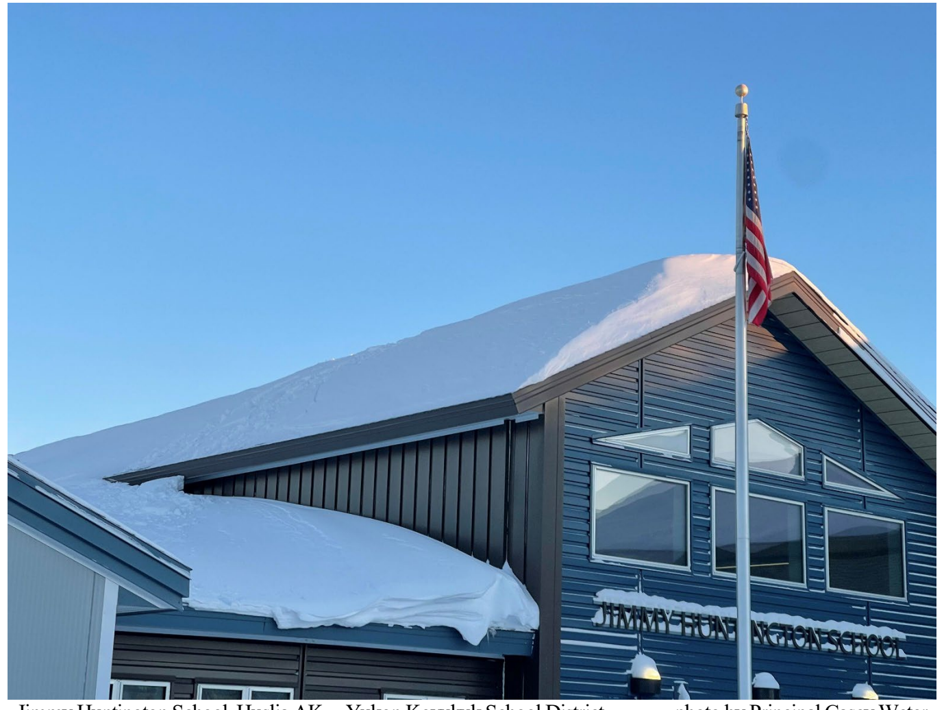
Jimmy Huntington School, Huslia AK Yukon Koyukuk School District